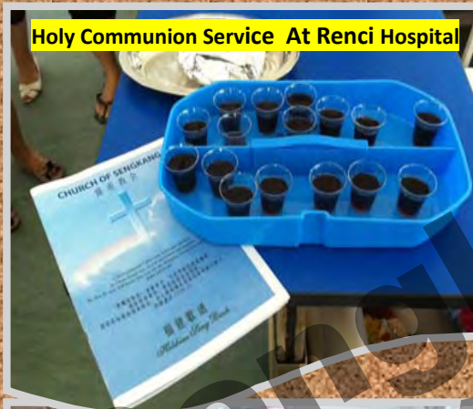
Holy Communion Service At Renci Hospital