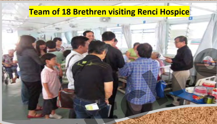
Team of 18 Brethren visiting Renci Hospice

蒙福的，为这组支持与信实的主内，经常地逐家传福音，将全荣耀和尊贵归于我主。我们做的乃是我主心所盼他教会完成的大使命，也是向盛港和榜鹅伸展的异象。