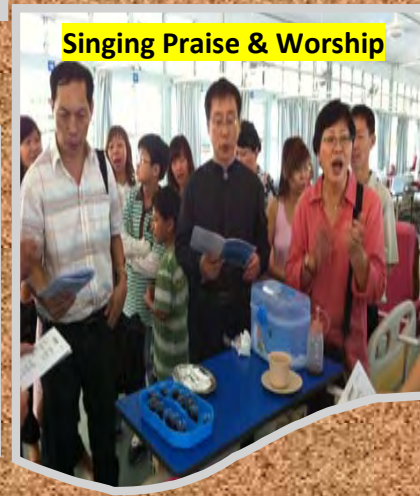
Singing Praise & Worship